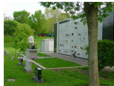
Mausoleum & Cremation Gardens...St Stephens